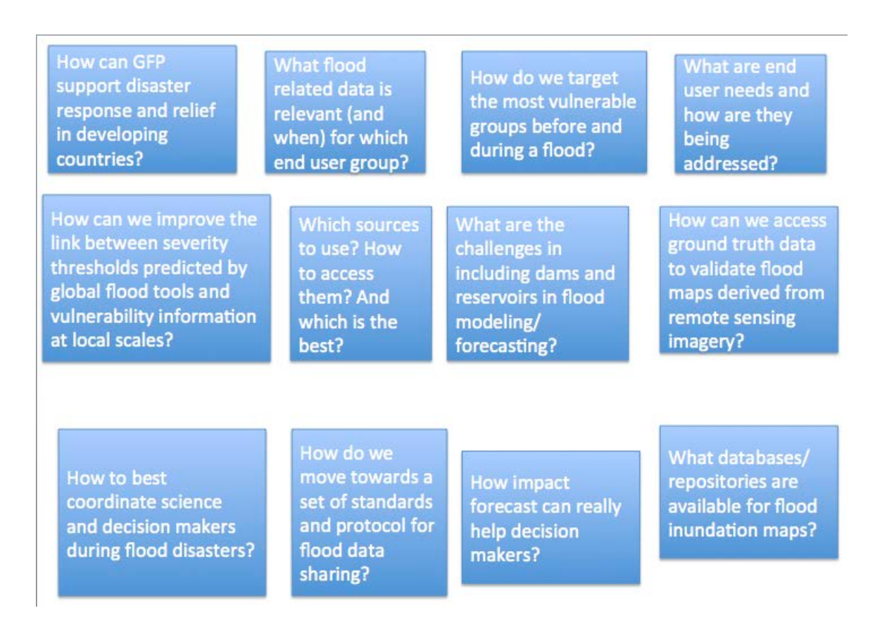
Figure 2: Array of 'patient' ailments, rephrased into questions for the 'doctors' to address. These were sourced from participants who volunteered to posit their challenges and in return receive information from experts