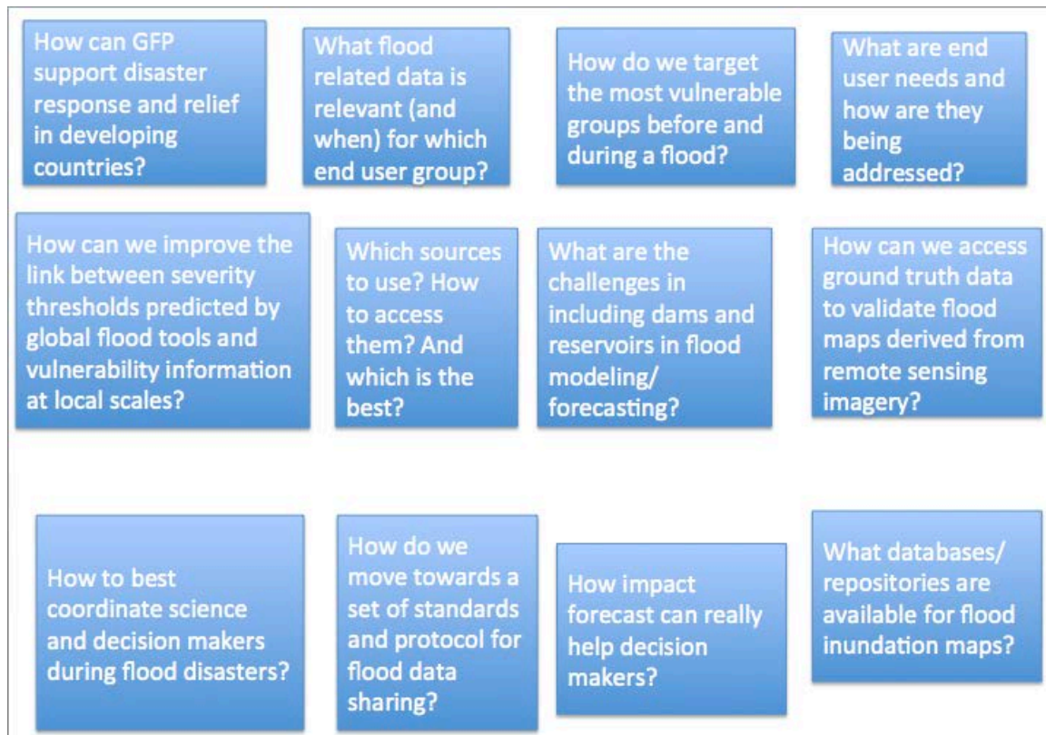
Figure 2: Array of 'patient' ailments, rephrased into questions for the 'doctors' to address. These were sourced from participants who volunteered to posit their challenges and in return receive information from experts